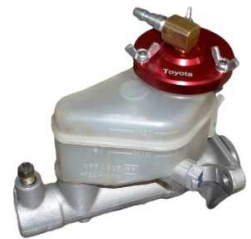
C800 Toyota - Lexus (1993 to current)