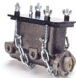
C300 Domestic Metal Reservoir