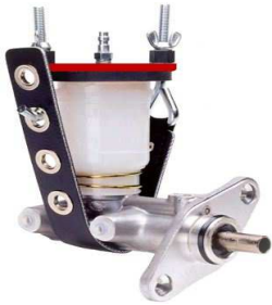
C100 Universal Round (1970 to current)