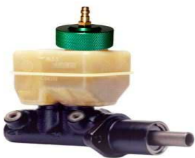
C400 European / Mazda (1972 to current)