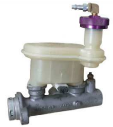
C1000 Nissan (2002 to current)