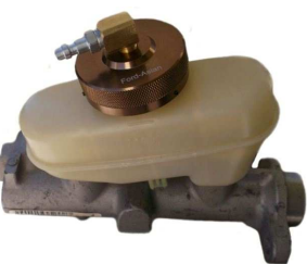
C500 Ford (1987 to current)