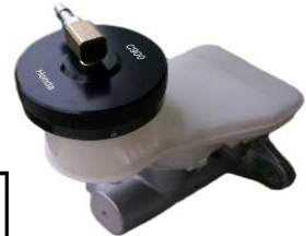
C900 Honda - Acura (1998 to current)