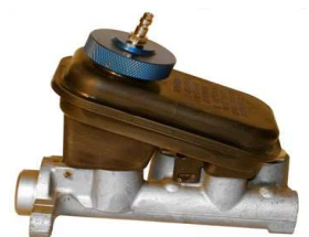
C600 GM (1987 to current)